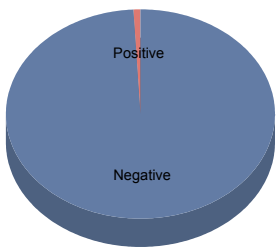
% Positive Specimens